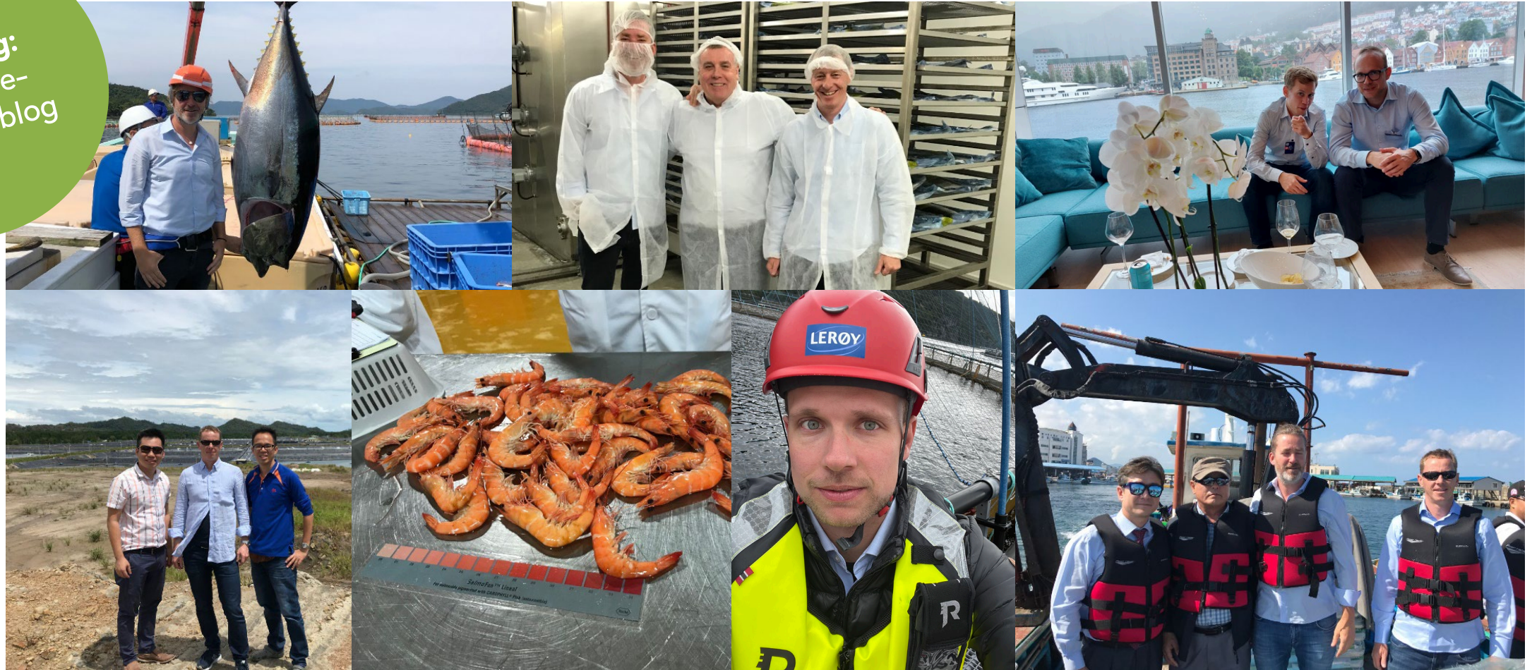
Bonafide employees on company visits.